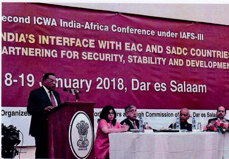
Tanzania Minister of Foreign Affairs, Dr. A. Mahiga (speaking) delivering the inaugural address at the ICWA Conference in Dar es Salaam on 18 January 2018. Seated are former Prime Minister, Dr. Salim Ahmed Salim (second, right), High Commissioner of India to Tanzania, Sandeep Arya (first, right).

with report from IMF suggesting that in 2019 India will be fastest growing large economy with predicted growth rate of 7.5 percent. Again an awe-inspiring plaudit to the way India has established its organs and structures working in effective manner through Constitution.